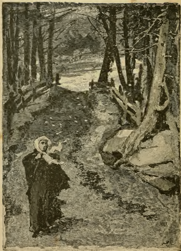
She ran to the footpath, and would have rushed wildly down the mountain.