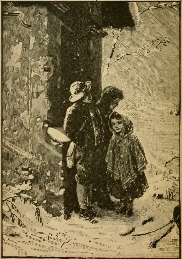
A large number of children were already out singing New Year Carols.