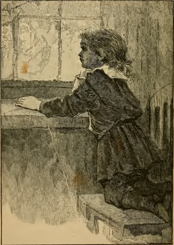
And one looked here, and one there at the window.