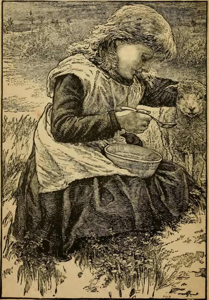
Sometimes they went to the pasture.